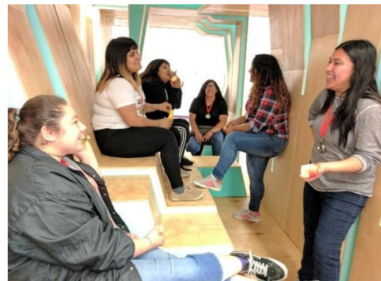
Mobile lounge where students can socialize, study, and/or rest