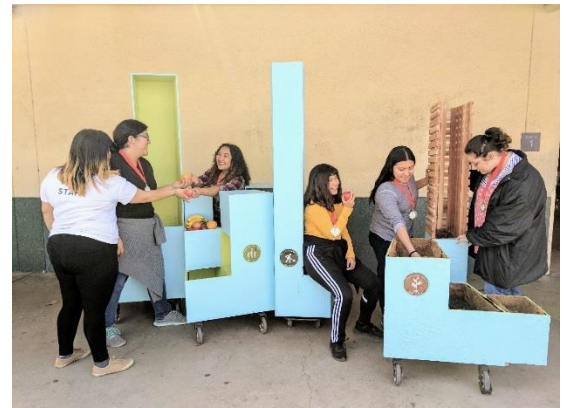
7-unit structure featuring mobile gardens, food storage and additional seating