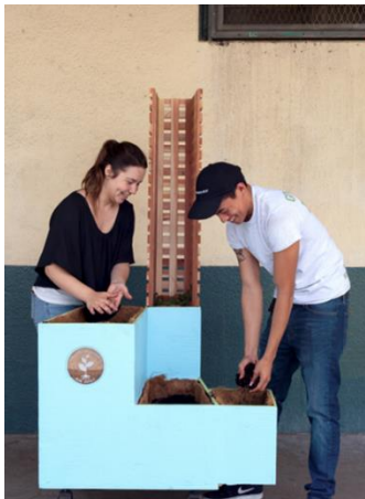
Mobile edible garden unit (part of a larger 7-unit structure)

Health Academy is an after-school program operated by National Health Foundation at Thomas Jefferson Senior High in Los Angeles. In the Health Academy, students work towards Champions for Change goals by focusing on nutrition education, policy, systems & environmental changes, and civic engagement. Last school year, the Health Academy successfully launched