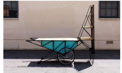
Multipurpose cart to hold food and other school merchandise to sell during football games and other school events

The result was the creation of four beautiful structures that not only aimed to beautify, but also to purposefully address issues around food waste, food security, and community engagement within the school.