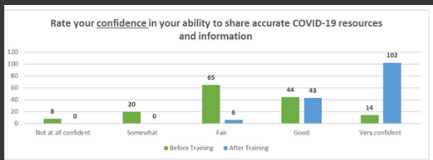
Figure 2. ECP Training 8/16/2022 evaluation results- confidence