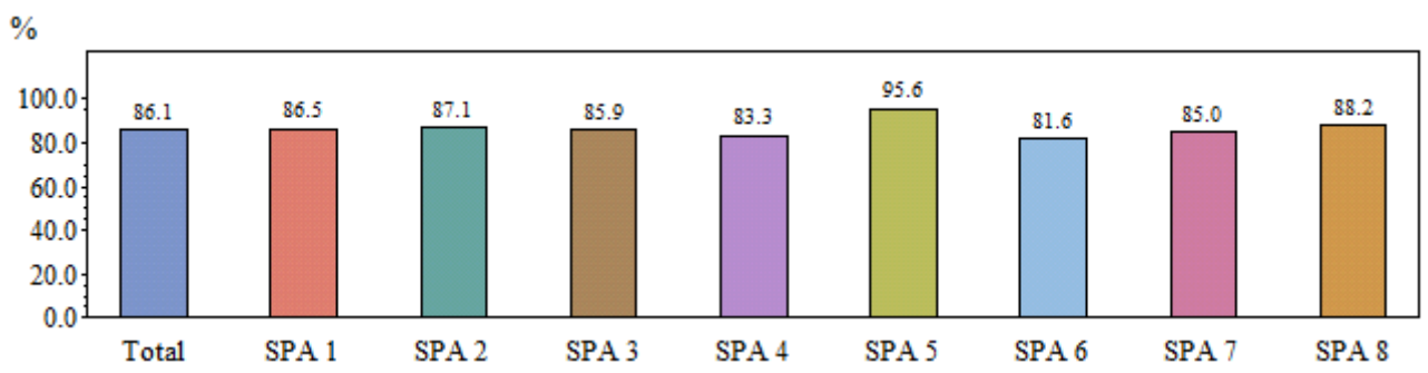
B. By Maternal Characteristics

The LAMB Survey asked mothers if they had someone to help them if they were sick and needed to be in bed during their pregnancy. A. By Service Planning Area (SPA)