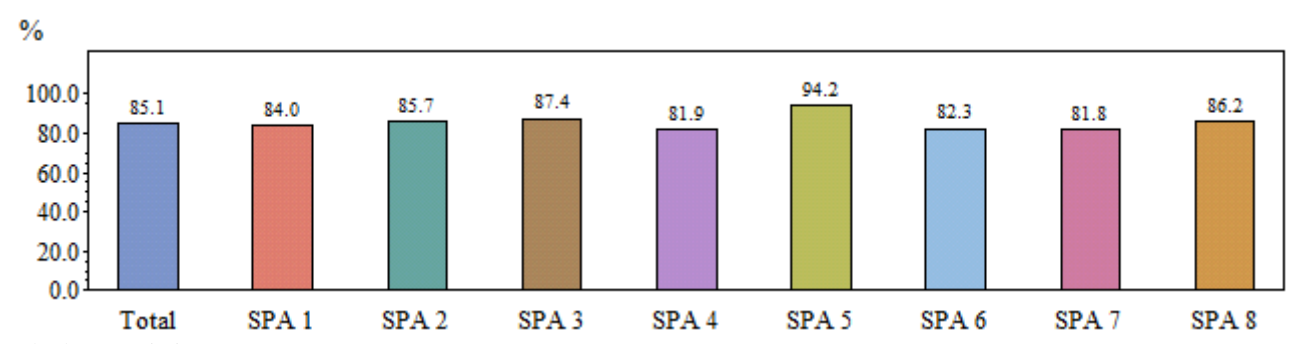
B. By Maternal Characteristics

The LAMB Survey asked mothers if they had someone to talk to about their problems during their pregnancy. A. By Service Planning Area (SPA)