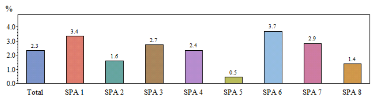
B. By Maternal Characteristics

The LAMB Survey asked mothers if they experienced domestic violence during the time that they were pregnant with their new baby. A. By Service Planning Area (SPA)