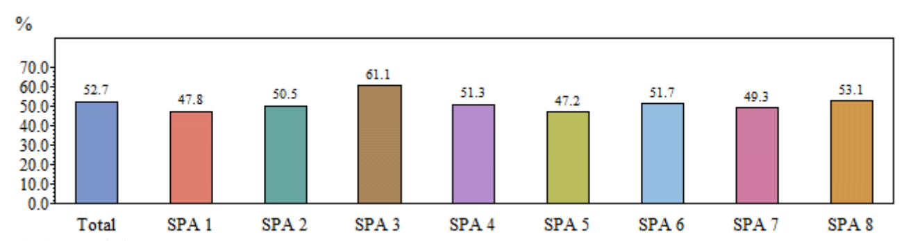
B. By Maternal Characteristics

The LAMB Survey asked mothers if, in the months after their new baby was born, they would say that they were not at all depressed. A. By Service Planning Area (SPA)