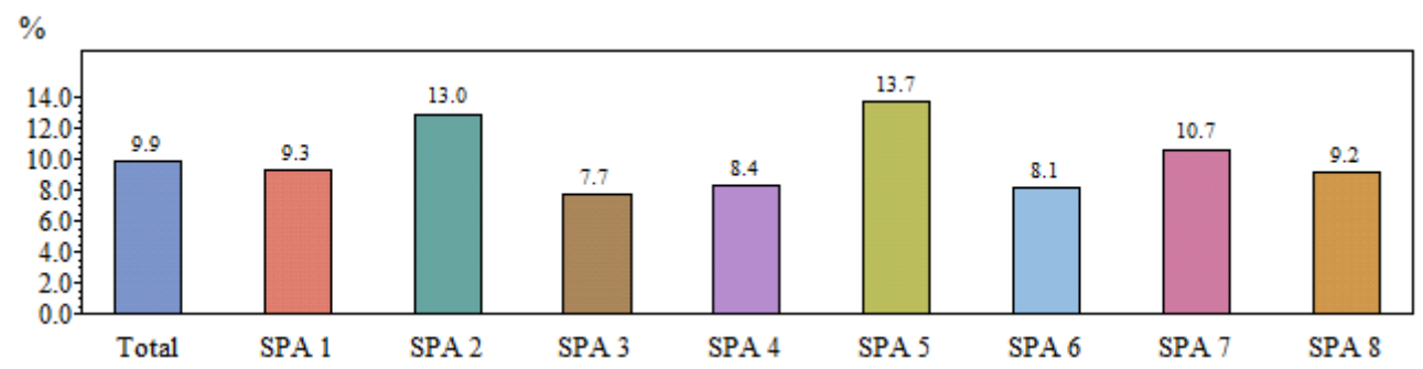
B. By Maternal Characteristics

The LAMB Survey asked mothers if, in the months after their new baby was born, they would say that they were moderately depressed. A. By Service Planning Area (SPA)