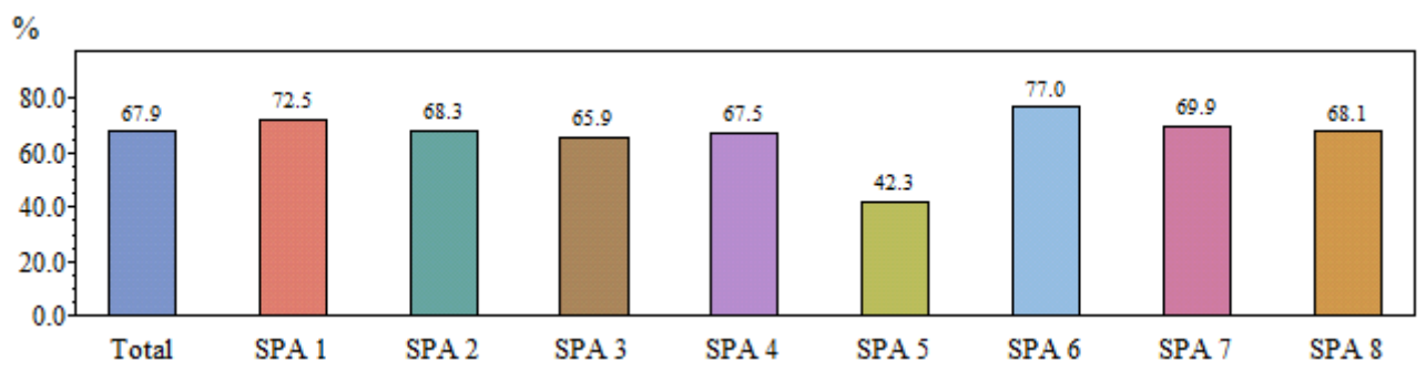
B. By Maternal Characteristics

The LAMB Survey asked mothers for the primary reason health experts say they should take folic acid before and during pregnancy. A. By Service Planning Area (SPA)