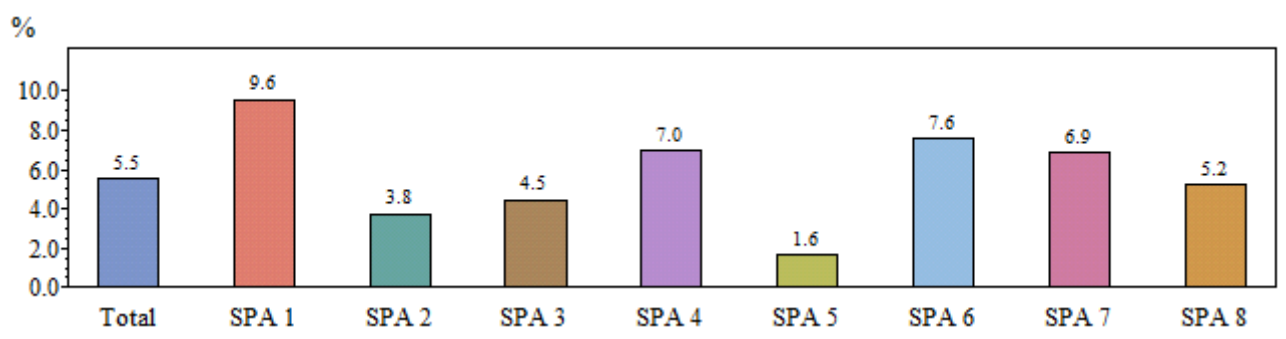
B. By Maternal Characteristics