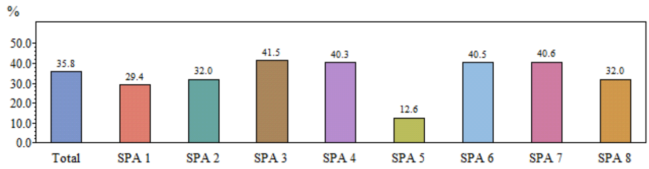
B. By Maternal Characteristics