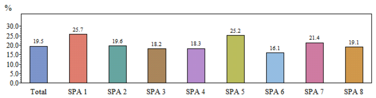
B. By Maternal Characteristics