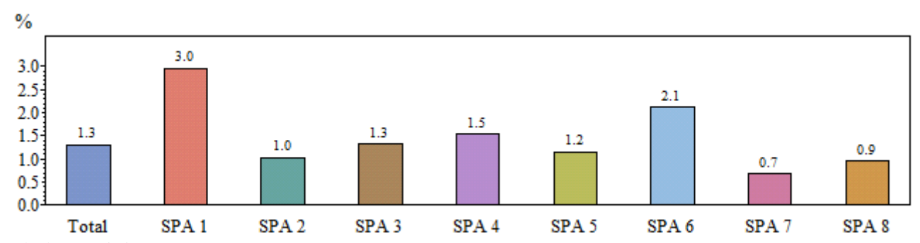
B. By Maternal Characteristics

The LAMB Survey asked mothers if they had ever had a stillbirth (a baby who died before delivery) before their last pregnancy. A. By Service Planning Area (SPA)