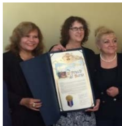
Winnetka clinic receives County Board of Supervisors Scroll