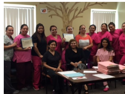
Winnetka staff – thanks for participating in our Tdap project as our 1 st pilot clinic

Pilot project expansion: We expanded our Tdap project to El Proyecto del Barrio clinics in Azusa and Arleta.