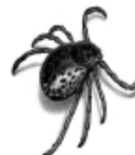
Female brown dog tick

The brown dog tick is dark, shiny, and has no markings. It is important primarily as a blood sucking nuisance of dogs, and is the tick most commonly found in dog kennels. Although the available literature states it is almost exclusively a parasite of dogs and rarely attacks humans, data collected by the Los Angeles County Department of Health Services indicate it frequently feeds on humans in this county.