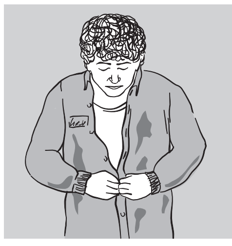
Change into clean clothes and shoes at work before you get into your car or go home. Put dirty work clothes and shoes in a plastic bag.