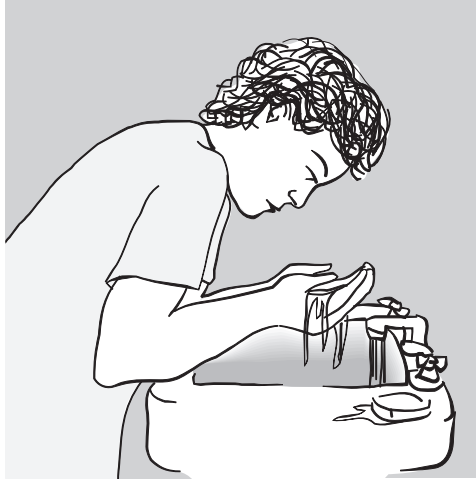
Wash your face and hands with soap and warm water before leaving work.