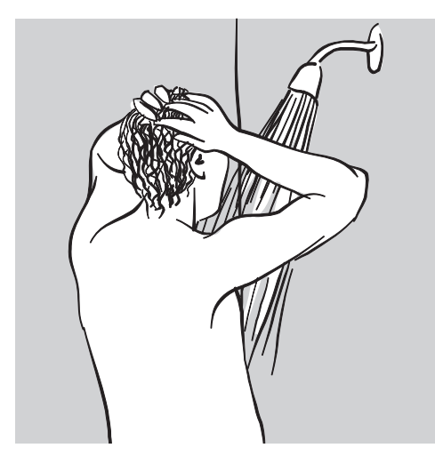
Take a shower and wash your hair as soon as you get home. (It is better to shower at work if you can.)