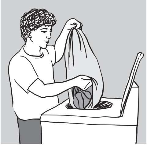
Wash work clothes separately from all other clothes. Empty your work clothes from the plastic bag directly into the washing machine and wash them. Run the empty washing machine again to rinse out the lead. (It is better if your employer washes the work clothes.)

The law says your employer must provide a place to wash your hands. In jobs where workers are exposed to high levels of lead, employers must also provide work clothes and a shower.