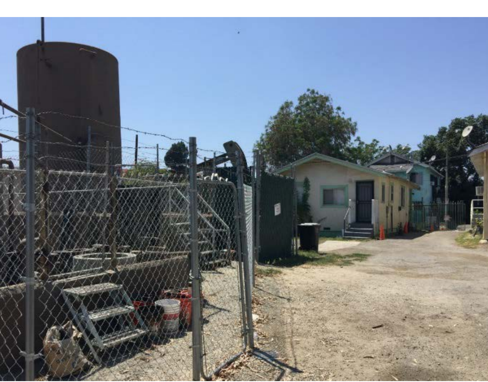
A tank farm and oil well in the backyard of a house on Firmin Street in Echo Park, California (August 2016)

Los Angeles County Department of Public Health February 2018