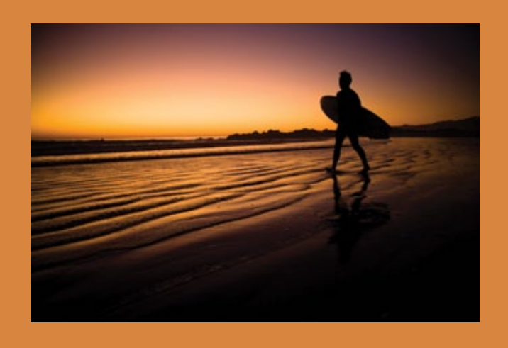
Our Vision Healthy people in healthy communities