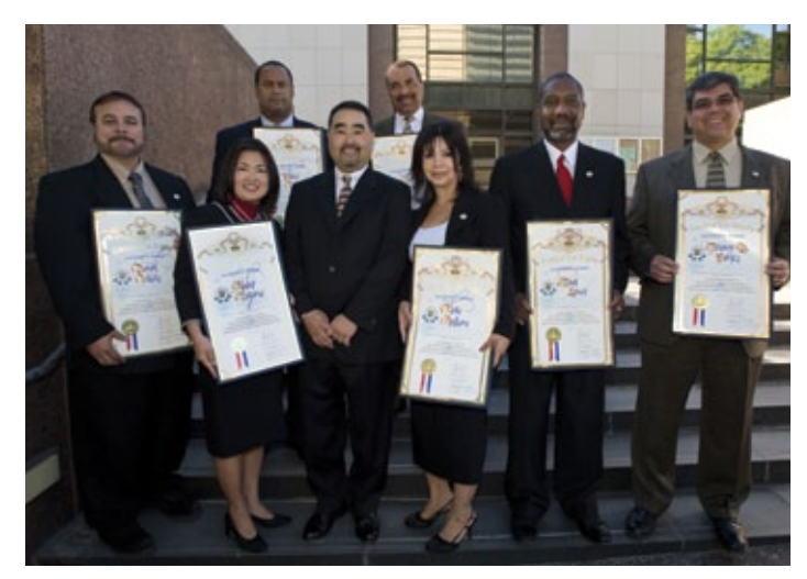
LA COUNTY STARS! Invoice Processing Workgroup