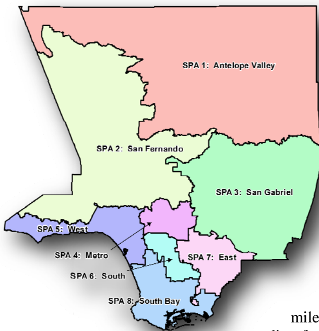
Figure 1. Los Angeles County Service Planning Areas (SPAs)

LAC is home to an estimated 62,800 people living with HIV/AIDS, of whom an estimated 13,500 are unaware of their status (Figure 2). In addition to the size and complexity of the HIV/AIDS epidemic, the continuum of HIV prevention and care services must be noted in the context of extreme demographic, socioeconomic, cultural and linguistic diversities in the County. The burden of HIV/AIDS in LAC is multiplied by the enormous number of HIV-infected people, co-morbid diseases, the extremely high numbers of people living in poverty and without health insurance, and the challenges of providing services across 4,084 square miles to individuals who are already